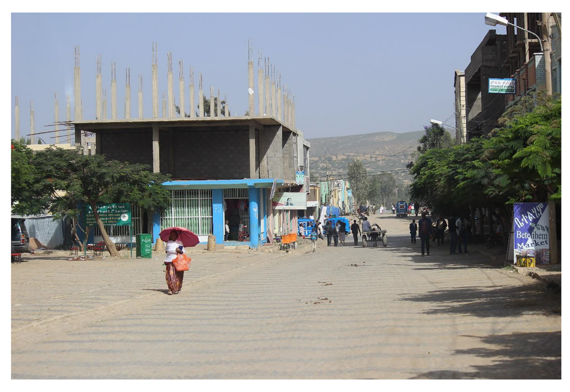
Fig. 1. The main road of Wukro.

people resorted to using different water sources. Water trucks were meant to be an official alternative water source, and some benefitted from regular water trucks (weekly), but most had never seen one in their area, despite water scarcity. The reselling or buying of water, though frequent practice, was illegal. People knew where to go to 'beg' for water at times of water interruption, but they were not informed (apart from a few respondents) when and if their tap water would flow, or whether the person will be willing to share their water. Many supplemented their water needs by borrowing or purchasing from neighbours, or informal water vendors, at costs ranging from 2 to 10 birr<sup>5</sup> [0.07–0.34 EUR] per 20-litre jerrycan, much higher than 5 birr [0.17 EUR] per 1000-litres through the piped network. Among water diary households 27 per cent of water expenditures accounted for water bought from neighbours or vendors. People were lacking entitlements (Mehta, 2014) to share water, access information or have control over water access. Despite these difficulties, the dynamics of the small town caused women to describe their water access in relation to others: those getting water once every-seven days would frequently note that, for them, it is manageable in comparison to others.