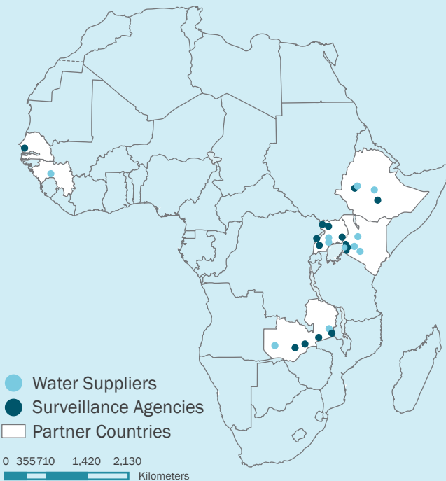
FIGURE 1: MAP OF THE SIX PARTICIPATING MFSW COUNTRIES.