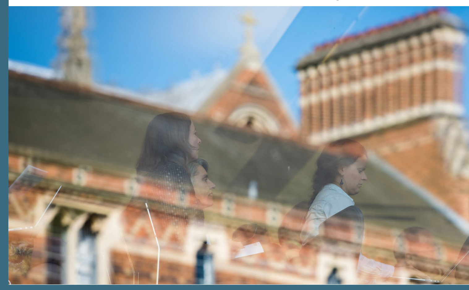
"Age is a big factor to feeling included and being able to participate. I'm often assumed to be 'just a' PhD student, and people can be very dismissive of speaking to me. When they learn I'm a deputy director, lecturer, and more they suddenly care." Survey respondent