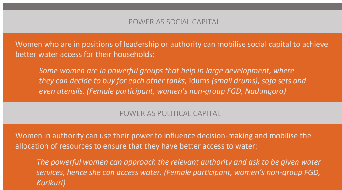
Figure 4.1. Ways in which a woman's power may improve water access

In Lekurukki, there was strong sentiment that women who are powerful can mobilise social, political, financial and knowledge capital to improve their access to water.