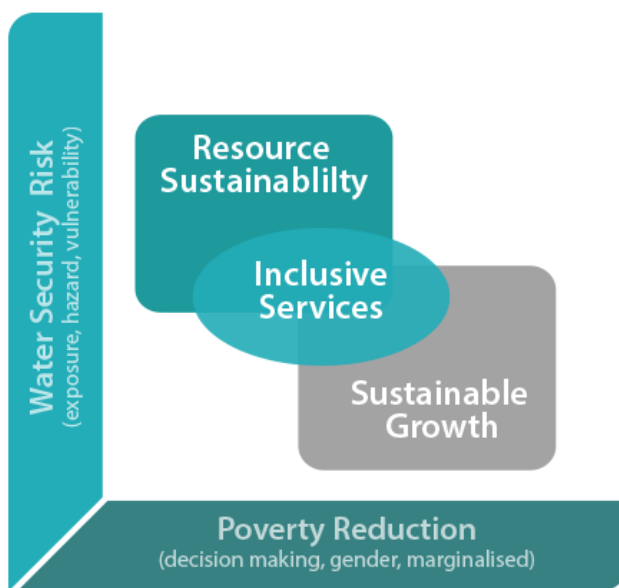
Figure 1 REACH conceptual understanding of Water Security Risk and Poverty Reduction

Resource sustainability, inclusive services and sustainable growth are not mutually exclusive but interact in different contexts with varying consequences (see Figure 1 below).